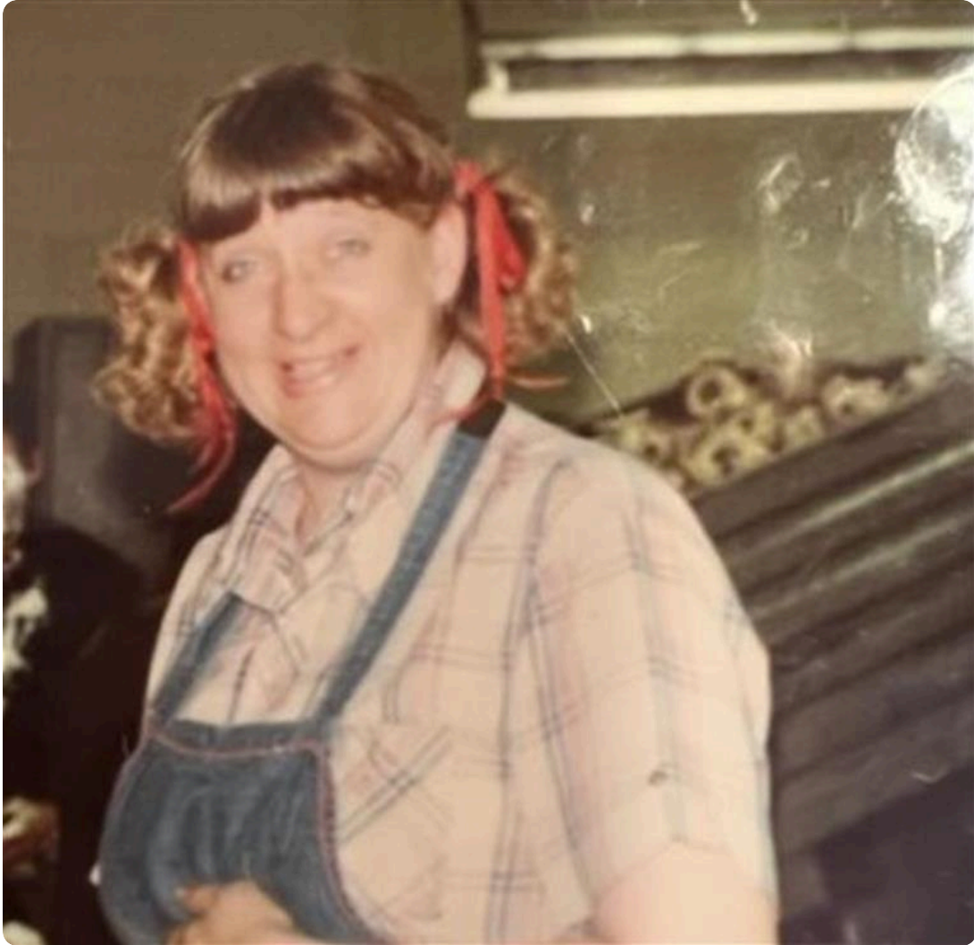
1980 something at the Brass