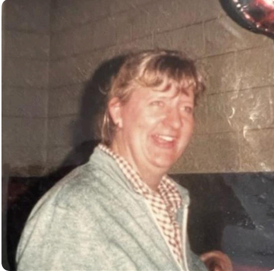
June in the 90's